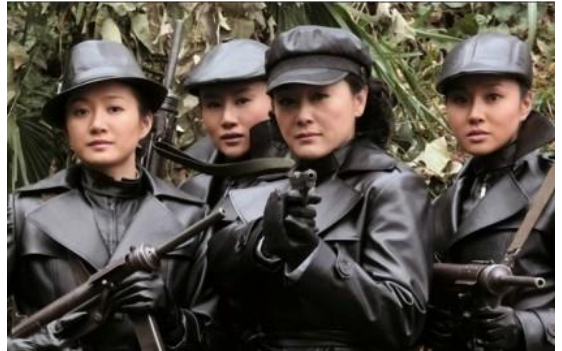
Scarlet Rose: the Goddesses of Jinling